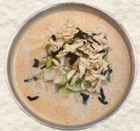
초계면 Cho Ghe Myeon

Cold Noodles Soup with Chicken and Peanut