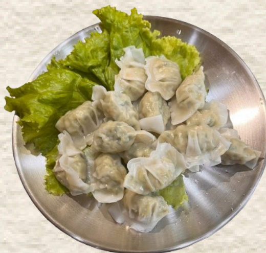
물 만두 ( 14 P ) Mul-Mandu