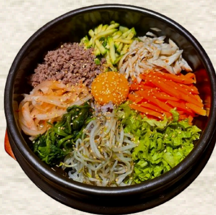
돌솥 비빔밥 Dolsot Bibimbab

Hot Rice Mix with Vegetables and Spicy Beef Sauce