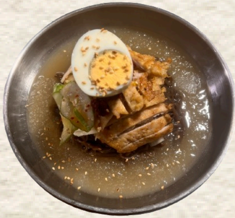
물 냉면 Mul Naeng Myeon