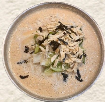
초계면 Cho Ghe Myeon