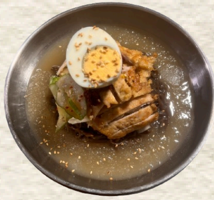
물 냉면 Mul Naeng Myeon