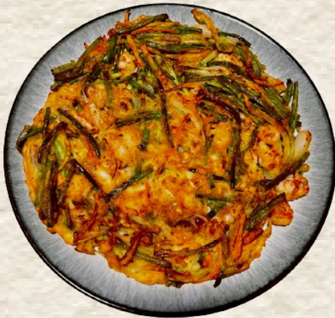
해물 파전 Haemul-Pajeon