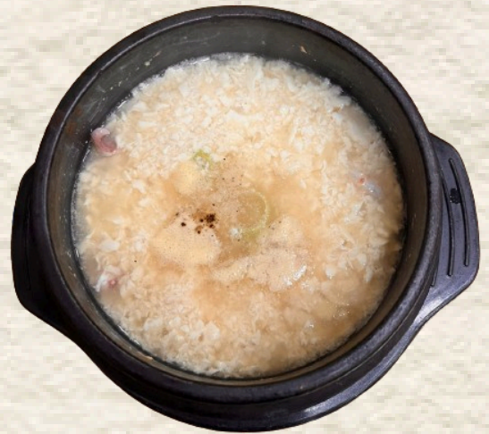
백순두부 찌개 Baek-Soon-Dubu jjigae