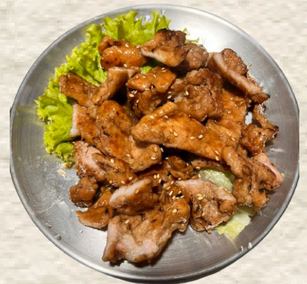
돼지 갈비 (0.5 P) Galbi Pork Ribs