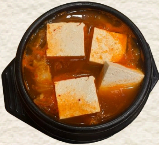
김치 찌개 Kimchi jigae