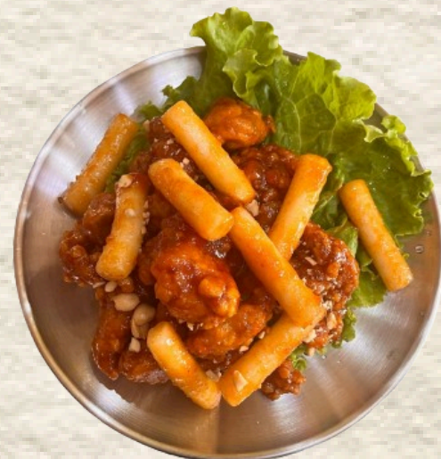
닭 강정 Chicken Gangjeong