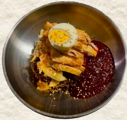
비빔 냉면 Bibim Naeng Myeon