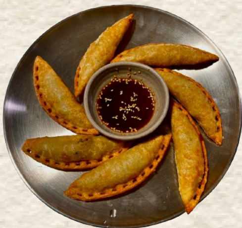
튀김 만두 ( 7 P ) Twigim-Mandu