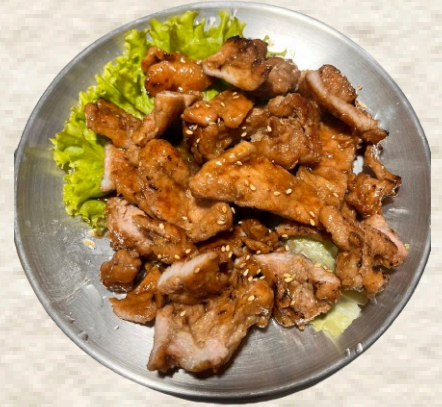
돼지 갈비 (0.5 P) Galbi Pork Ribs