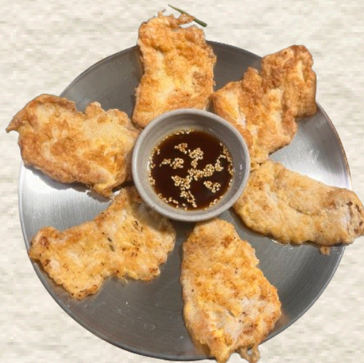
육 전 ( 6 P ) Yuk-jeon