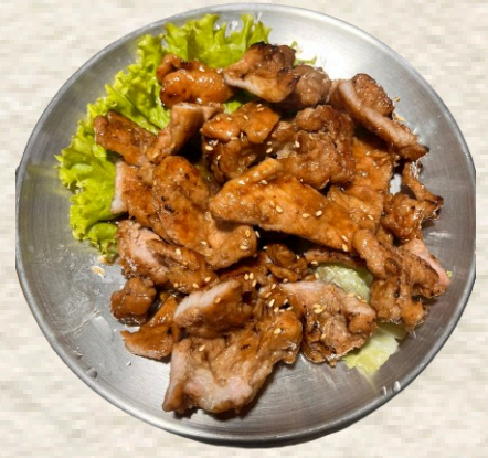
돼지 갈비 (0.5 P) Galbi Pork Ribs